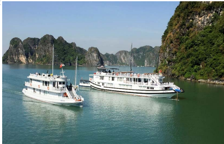
Cruising through Ha Long Bay

On November 2, 2015, our tour group boarded the Paradise Luxury Cruise (built according to the traditional junk rig design) for the purpose of cruising through Ha Long Bay (known as “where the dragon descends into the sea”). According to our tour guide, legend tells that this mystical seascape was