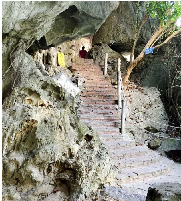
Steep Steps up to Sung Sot Cave

which rise out of the bay to heights of up to 330 feet. In addition, there are numerous caves and grottoes that spread throughout the bay. Designated a World Heritage site in 1994, Ha Long Bay's spectacular scatter of islands, dotted with wind and wave eroded grottoes, is a vision of ethereal beauty and Northern Vietnam's number one tourism hub.