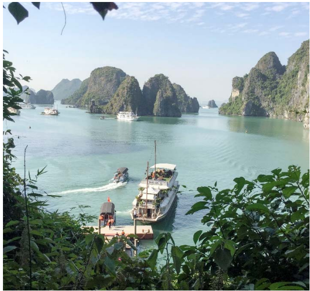
View from the top of Song Sot Cave

Walking up through steep stone steps, a few of our tour group members had a feeling of climbing a mountain and experienced the excitement as if they were stepping to the sky. Sung Sot Cave is divided into two main areas. The first one is like an immense theater. The ceiling of this area is covered by stalactites and stalagmites, which has the appearance like a silky “velvet carpet” with beautiful motifs or a myriad of glistering and aglow chandeliers. Entering the second area through a small path, we were able to enjoy a completely different space in comparison to the first one. At the side of the entrance, the rock seems to form the