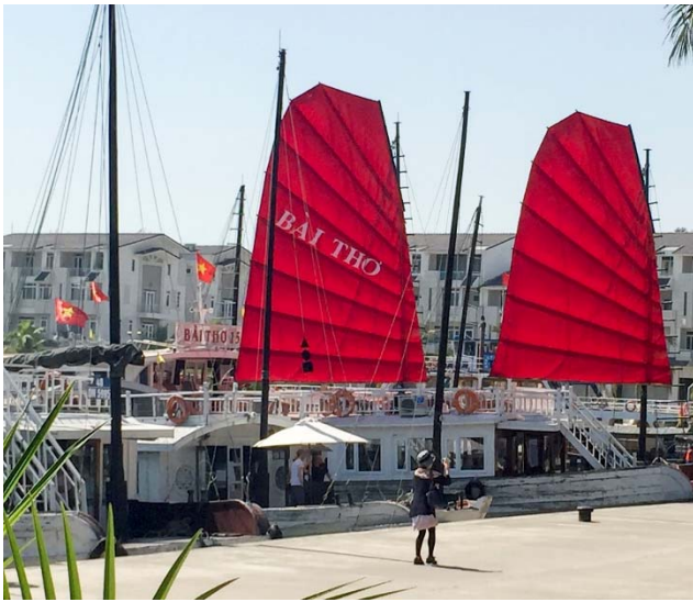
Photo of Traditional Junk Rig

created when a giant mountain dragon charged toward the coast, its flailing tail gouging out valleys and crevasses. As the creature plunged into the sea, the area filled with water leaving only the pinnacles visible. Ha Long Bay is one of Mother Earth's most amazing natural wonders and one of Vietnam's most prized treasures. Located on the shores of the Gulf of Tonkin, Ha Long Bay is dominated by more than 1,600 limestone karsts and islets