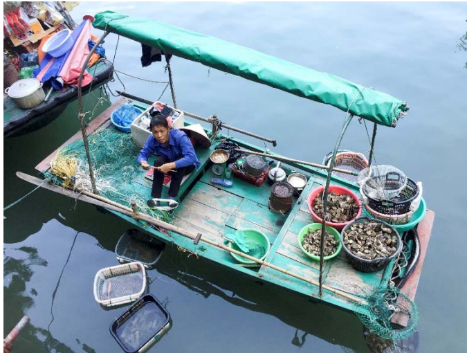
Local Merchant at Ha Long Bay

shape of a horse with a long sword. As we traveled further inside Sung Sot Cave, there were many surprising sceneries waiting for us to explore, such as stalactites having many different shapes. The formations in the cave inspired a lot of interesting imagination of human and animals in varying poses. In addition, the cave was disturbed by monkeys that were looking for fruits which made for a lively landscape.