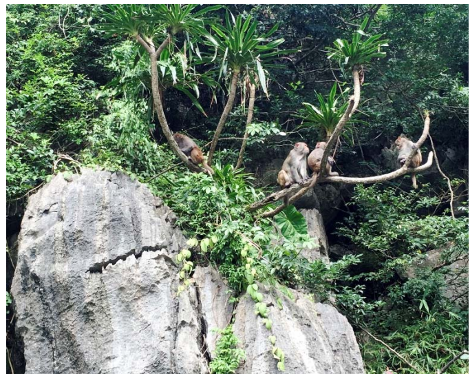
Gold Monkeys at Luan Cave

Glide across the emerald waters of Vietnams Ha Long Bay and be prepared to be whisked away from a cosmopolitan city to a serene landscape. With more than 300 spectacular limestone islands, Ha Long Bay in Vietnam is one of the most visually stunning places in the world. We were able to sit back relax and