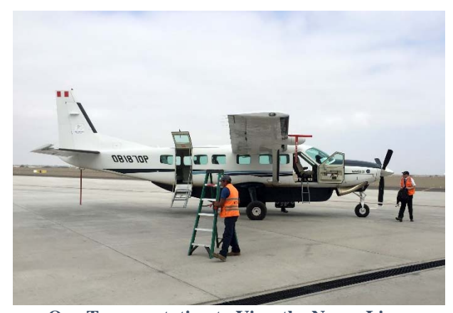
Our Transportation to View the Nazca Lines

With a strangely shaped head and giant round eyes, the 130-foot tall geoglyph etched into the hillside looked like a confounded alien waving