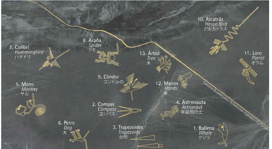
Nazca Lines Illustration Guide

All of these theories have their doubters, but most researchers believe the Nazca Lines in some