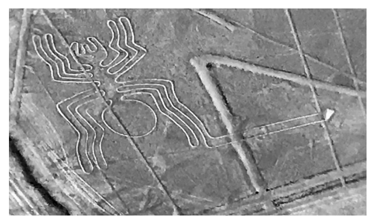
Creepy 150-Foot-Tall Spider

The purpose of the Nazca Lines continues to elude researchers and remains a matter of conjecture. The ancient Nazca culture was prehistoric, they left no written