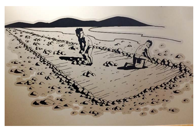
The ancient inhabitants of Nazca removed the reddish stones. This way, they created furrows where stone contrast with the lightest ground shade.

Inca ruins, the Amazon Jungle and fascinating tribal customs are the top reasons why Peru ranks among the world's great centers of ancient civilizations. Located in the Peruvian coastal plain some 400 km south of Lima, Peru is home to the Nazca Lines, a collection of geometrical patterns or geoglyphs etched into stone surfaces under the desert sand thousands of years ago. The geoglyphs include various geometric forms like triangles, spirals and trapezoids as well as intricately designed fauna such as a spider, condor, monkey and lizard. According to our tour guide, the latter, which are technically called biomorphs, are largely